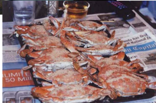
Some of last year's winners