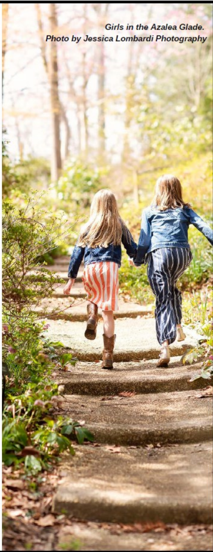
Girls in the Azalea Glade.

Plan your visit today at www.historiclondontown.org/visit